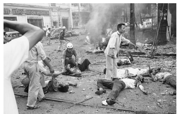
Injured Vietnamese receive aid as they lie on the street after a bomb explosion outside the U.S. Embassy in Saigon, Vietnam, March 30, 1965