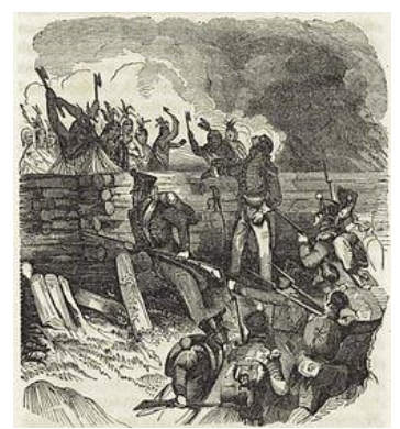
The Battle of Horseshoe Bend