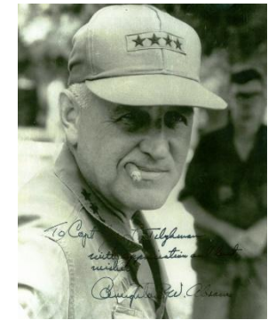
Gen. Creighton Abrams