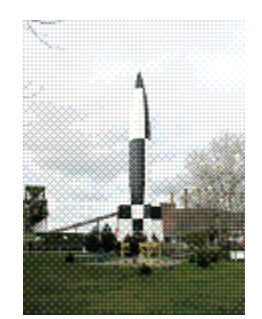
Peenemünde Museum replica of V-2