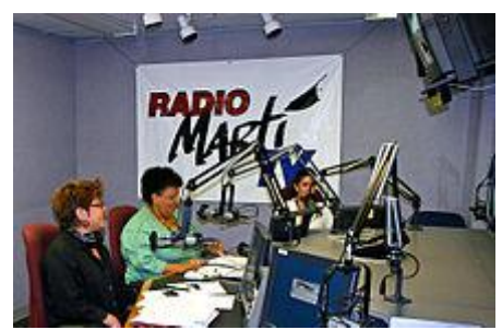
Radio Martí broadcast studio